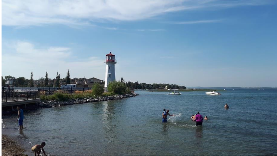
LAKE – SUMMER

Sylvan Lake's population of 17,825 (2021 estimate) having grown from 7500 residents in 2001 is a powerful indicator of the community's attractiveness for growth. Given its size Sylvan Lake provides many of the amenities of larger sized communities. Its 11 minute proximity to Red Deer with a population of just over 100,000 ensures that Sylvan has all or more of the amenities within a shorter driving distance than many outlying suburbs within the boundaries of Calgary and Edmonton. In other words all of the benefits of big city living in a relatively quiet community with a beautiful recreational lake.