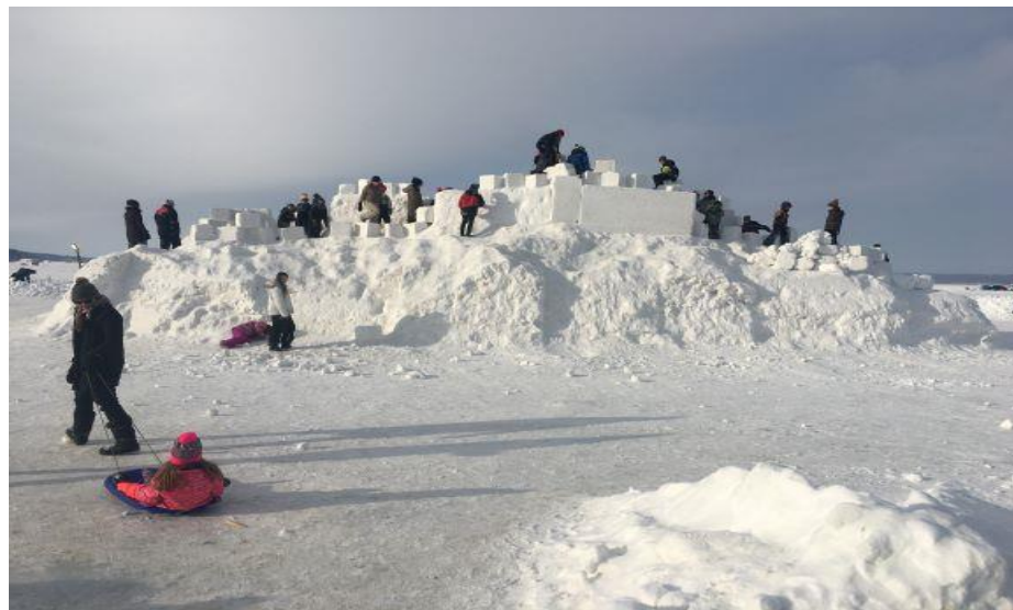
LAKE – WINTER

Disclaimer: The information contained herein is derived from sources believed reliable; however, no warranties or representations are being made regarding such information by MNP Ltd. (Receiver) Royal LePage Commercial – Mission and Royal LePage Noralta or their associates, including the potential income, costs, or profits associated with the property. Interested parties are strongly advised to consult qualified professional investment, financial and tax advice. All offices are independently owned and operated, except those offices marked as "Royal LePage Real Estate Services Ltd." Royal LePage is a registered trade-mark used under license. © 2012 Brookfield Real Estate Services Manager Limited.