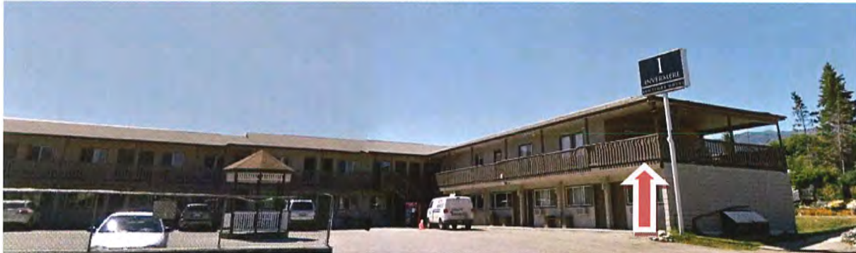
27/28 Room Motel with lovely 3 Bedroom Residence HUGE balcony with Lake View