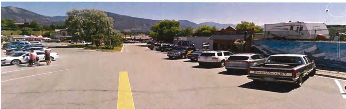
Front Street View